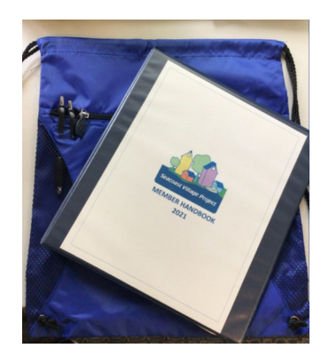
Members-Only Event New Member Q&A

Bring your lunch and join us on the porch for a mid-week meet up each month. This is an informal opportunity to meet and get to know other Village members. Please note there is no furniture on the porch, so please plan to bring a chair or blanket to sit on.